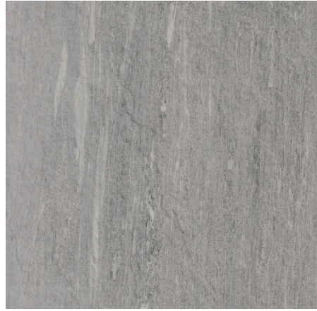
MYSTONE PIETRA DE VALS Greige